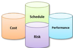
Multiple Data Sources and File Formats

“Our ultimate goal is to deliver solutions which will exceed client expectations!!!”